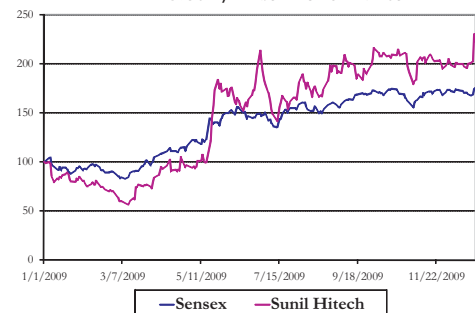
1 Yr Stock / Index Performance